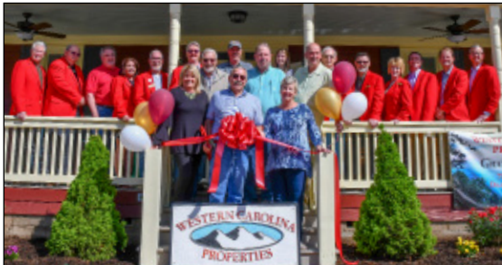
At right, Chamber Ambassadors are shown at a ribbon cutting celebrating another chamber member business grand opening.

Ability to communicate with all chamber members utilizing our business database.